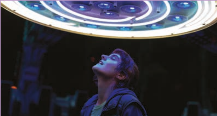
Jumbo by Zoé Wittock (Belgium, France, Luxembourg)