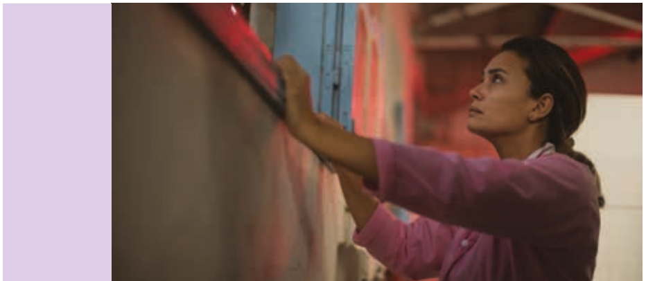
Noura's Dream by Hinde Boujemaa (Tunisia, Belgium, France)

The script has to be submitted in French even if the film is shot in another language.