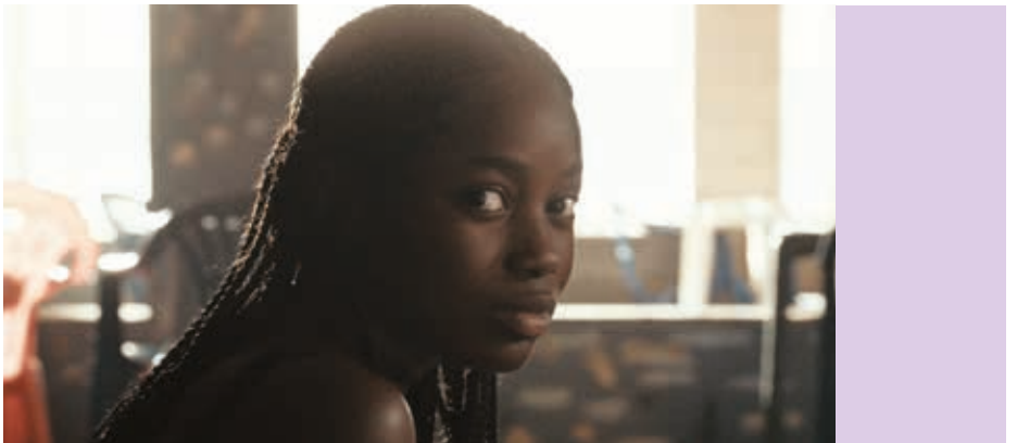
Atlantics: A Ghost Love Story by Mati Diop (France, Senegal, Belgium)